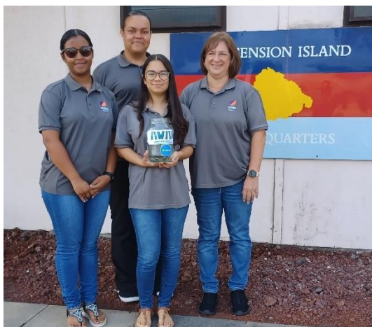
(Mitie Staff Airhead)