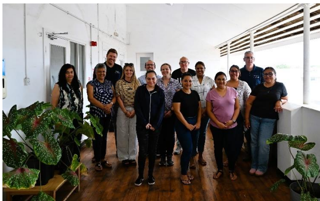
(AIG Admin Staff)