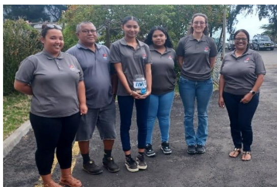
(Mitie Staff Yard)