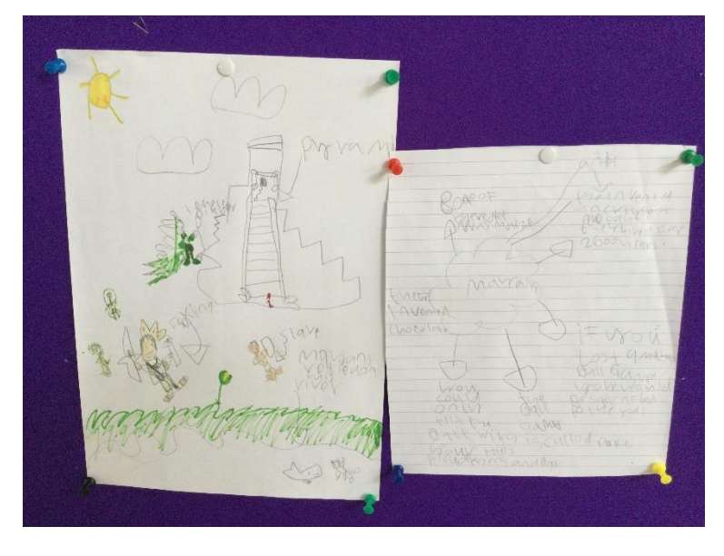
Information text/Posters, explaining the Mayan civilization