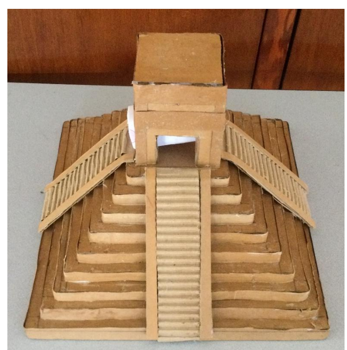
Creation's of the Mayan temples.