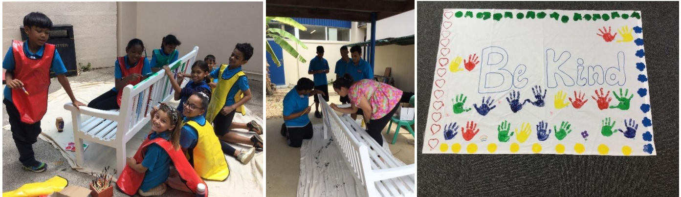
(Top L-R: Students painting benches and work in progress banner)

Interestingly, the year 7s had created a 'Proud Work' blog to highlight some recent work they were particularly pleased with, and this had been cruelly trolled by some anonymous online user! Although unpleasant, this enabled the year 7s, and year 8&9s to have some good discussions in PSHE about how to deal with online abuse and hate speak, so in the end it was a useful opportunity. As the Island opens up more to the digital online world, via Starlink and other providers, it's important that our students become more aware of the dangers and issues that might arise, and how to be alert to and deal with them. We hope the 'Proud Work' site will be up and available via our TBS Ascension Facebook site soon, minus any negative reactions! Then you can all marvel at and post some positive comments about the great work our students are producing.