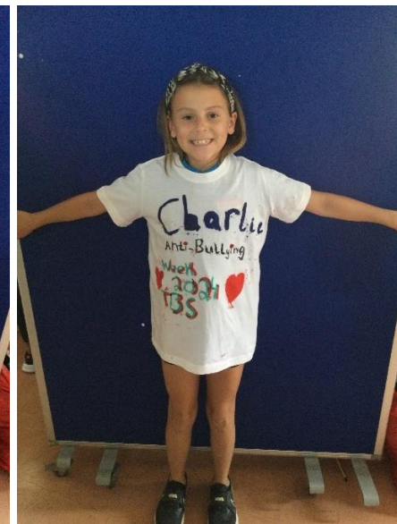
(Top L-R: students creating T-Shirt logos)

The 'Paint a Buddy Bench' activity was also really exciting. Lots of colour and great imaginative ideas. Once completed, these benches can now be used in the KS2 and Senior's break areas to provide a space for students to sit if they feel they need some friendship support. The EYFS class made their own banner too which will now go up outside in the KS1 playground for a while.