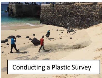
Conducting a Plastic Survey