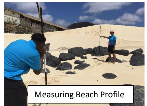
Measuring Beach Profile