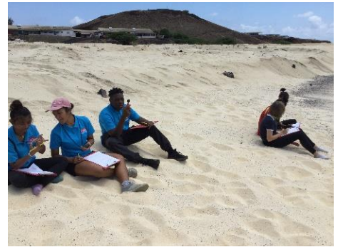
Measuring Wave Frequency