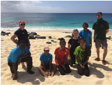
Year 11 GCSE Students