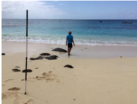
Measuring Long Shore Drift