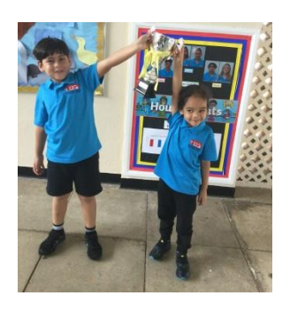
Stars of the week!

Winners of the house cup this week are Elliots with 150 points.