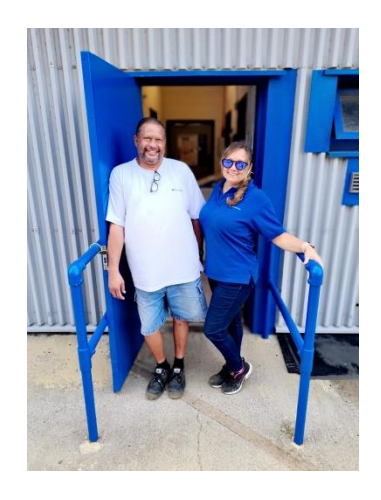
(Encompass – Power Station)