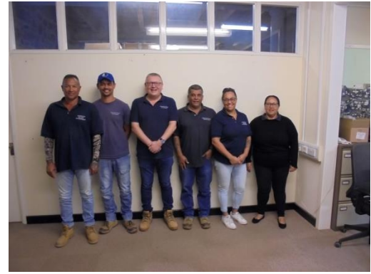
(Facilities & Operations)