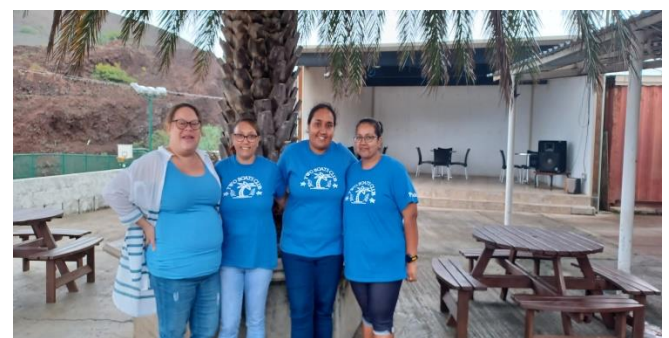
(Two Boats Club)

Thank you to all the companies on the Island for supporting us in this, please do remember to send us your photos if you haven't done so already for our next edition of the newsletter. We will also let you know the total money raised next week.