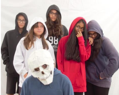
No Motivation and Fast and Furious