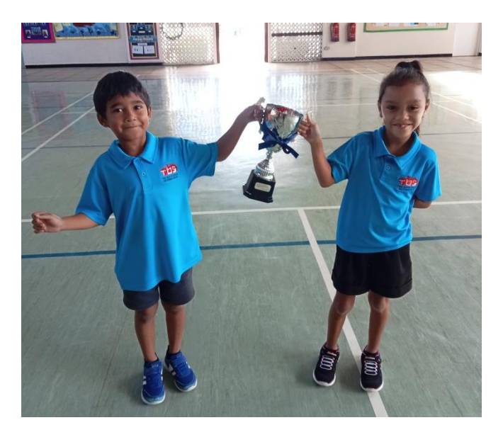
Top students this week: Well done girls!

Weekly winners this week were Cronks. Great Job Guys!