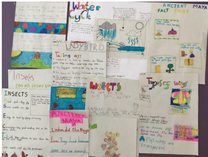
We hope you enjoyed looking at our work.

We have linked our study of information texts with both our Humanities topic and our Science. Here are some examples of information pages: