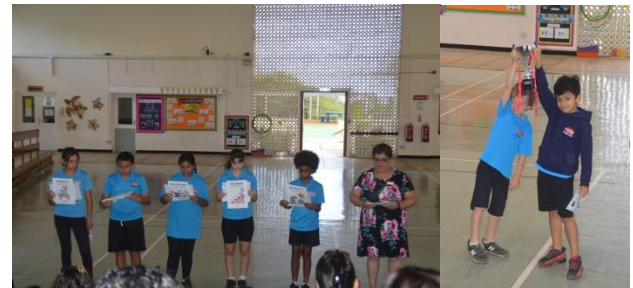
(Above L-R: Year 7 Assembly and this week's winners Dampiers).