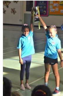
Left: Weekly winners- Elliots

This week however the weekly house point cup goes to Elliots house and Dampiers won the secondary ICT tutor quiz. Well done to both teams!