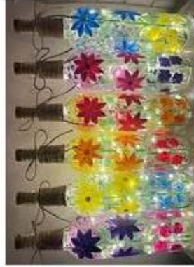
Light up Hand Painted bottle (Design will vary)