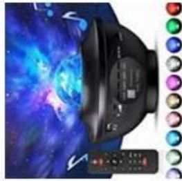
Sure – Smart jump rope