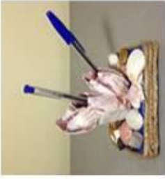
Shell Pan Holder (Design will vary)