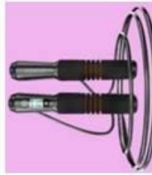
Sure – Wave light Projector