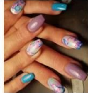
Nails by Geita - Voucher