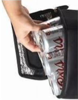
6pk drinks cooler From Boyz2men