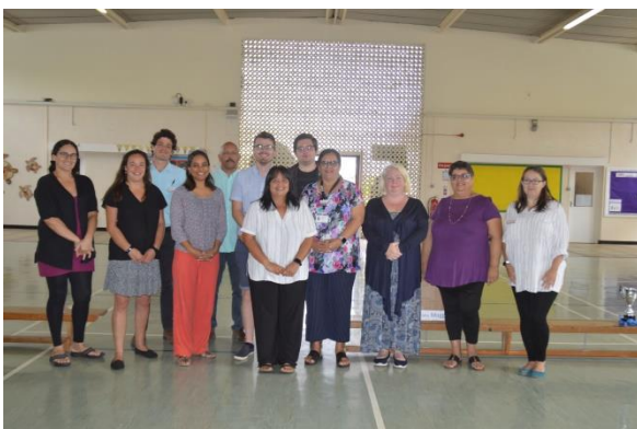
(Two Boats School Teachers)

Tuesday 5 th October was World Teacher Appreciation day. Year 9 held an assembly of celebration and appreciation to thank all the teachers. Each teacher was gifted a bag from the children and parents. We were certainly overwhelmed by the support shown so Thank you all so much. I would like to add my personal thanks to all the teachers for their hard work so far. It has been an incredibly busy start to the term