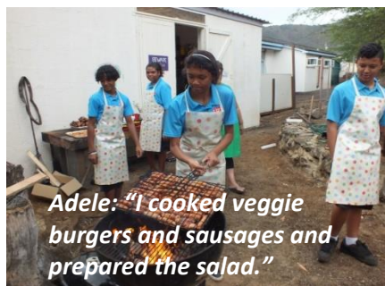
Adele: "I cooked veggie burgers and sausages and prepared the salad."