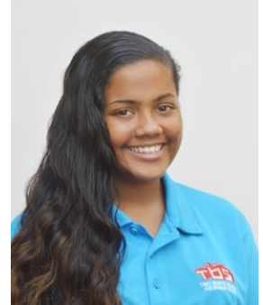
'Year 3 and 4 cast their votes for our Head Pupil elections'