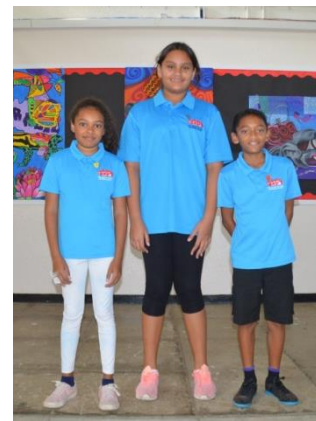
Primary House Captains