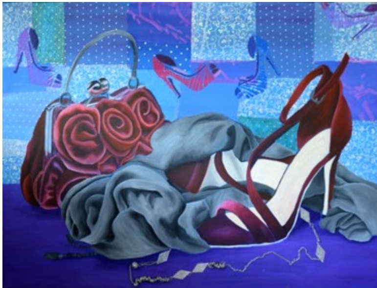
Tate focused on 'Fashion Accessories'.