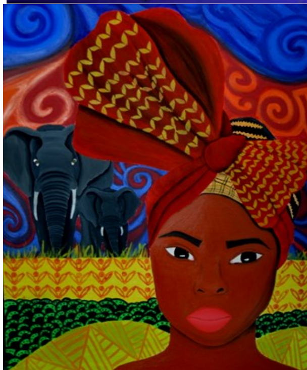
Chloe worked on the theme: Africa

Coursework in art allows students to explore and experiment with direct observational studies in various media as well as mixed media concepts. They explore art processes and are encouraged to work in the style of different artists, art movements as well as environmental and cultural influences .