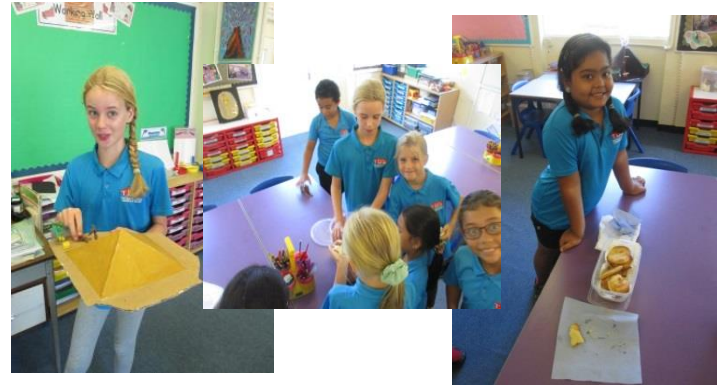
Our Egyptian themed Assembly this morning.